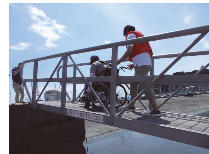
Photo Wheelchair during the proving test of a connecting bridge

An NPO that supports sailing activities by disabled people has drawn up the Guideline to Marine Facilities for Disabled People in preparation for the 32nd Tokyo Olympics and Paralympics, and the MLITT Ports and Harbours Bureau and the NILIM Coastal Zone Systems Division have provided technical advice to the NPO and assistance with this initiative. On June 12, 2017, the first proving test to confirm the safety of a marina for wheelchair users, which is a nationwide initiative, was conducted at Shonan Harbor in Kanagawa Prefecture, clarifying the relationship of the gradient and usability of a bridge connecting the top of the revetment with a pontoon. The results showed that depending on the tide level, the gradient of the connecting bridge makes it difficult to move a wheelchair up the bridge, and even at the 1/12 grade which is the standard for normal universal design, it is dangerous and difficult for a wheelchair user to use the bridge alone. It also revealed the need to install handrails or decks made of materials that resist slipping. The future position of this result in the guidelines and other matters will be studied.