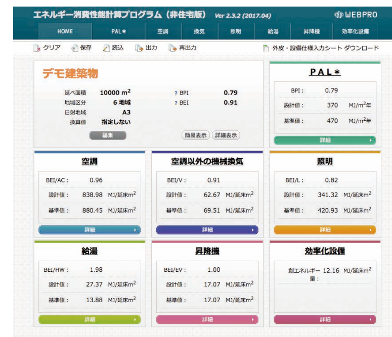
Figure 1. Interface of the Primary Energy Consumption Calculation Program for Non-residential Buildings

http://www.nilim.go.jp/lab/bcg/siryou/tnn/tnn0974.htm