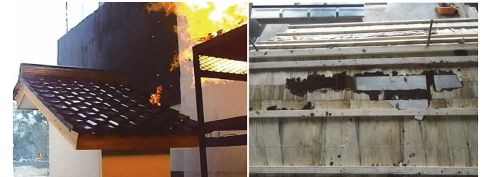
Photo 1 Test of fire ignition by sparks

On many of these buildings, fire damage was limited to the roof or the fire started on the roof and then spread to the rest of the building, so fire tests were performed to confirm whether or not sparks passed through the tiles and ignited the roof underlayer (Photo 1). The testing was done by preparing specimens using tile roofs based on prewar specifications common in that region and specimens of tile roofs based on modern specifications, and then comparing the frequencies with which each type of specimen caught fire. The results confirmed that when the wind was blowing at 10 m/s, on the tile roofs based on prewar specifications, the roof underlayer burnt through (Photo 2), but on the tile roofs based on modern specifications, it did not burn through.