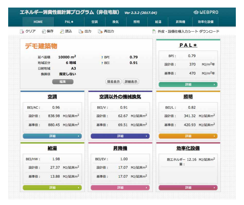
Figure 1. Interface of the Primary Energy Consumption Calculation Program for Non-residential Buildings

Details NILIM website (Technical Note of NILIM No. 973, 974) http://www.nilim.go.jp/lab/bcg/siryou/tnn/tnn0973.htm http://www.nilim.go.jp/lab/bcg/siryou/tnn/tnn0974.htm