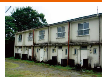
Photo 1: It is necessary to remove deteriorated housing in existing public wooden emergency temporary housing estates and build new public housing to reconstruct damaged

Therefore, the Housing Department is providing technical guidance to cities, towns and villages in the disaster region and to consultants involved in restoration work in response to a request by the MLITT in a program implemented this year by the MLITT Housing Bureau: Restoration Survey of Homes and Hamlets in the Kumamoto Earthquake Disaster Region. The surveys are conducted in 10 cities, towns, and villages designated as severely damaged regions (Aso City, towns of Minamiaso, Nishihara, Ozu, Mashiki, Mifune, and Kosa, Uto City, Uki City, and Kashima Town) which have a particularly great need for assistance. The goals of the surveying are 1) clarifying the intentions of disaster victims regarding home reconstruction, 2) preparing basic guidelines for restoration, etc. of homes and hamlets, 3) studying the application of specific construction methods (housing environment improvement projects such as damaged public housing improvement projects and