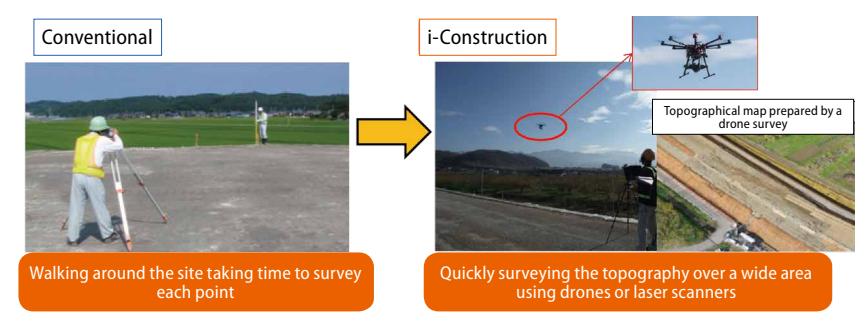
Speeding up the initial surveying

Details • i-Construction Promotion Headquarters website http://www.nilim.go.jp/japanese/organization/ic honbu/indexicon.htm