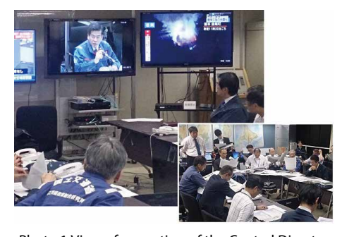
Photo 1 View of a meeting of the Central Disaster Response Committee held concurrently with the MLITT Headquarters Emergency Disaster Countermeasure Committee (before dawn on April 15)

Details * State of NILIM disaster surveys and technical support activities in response to the Kumamoto Earthquake http://www.nilim.go.jp/lab/bcg/kumamotojishin2016.html