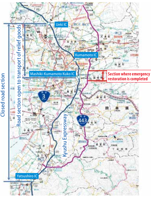
Figure Smooth transport ensured by emergency restoration (From a Road Bureau press release)

Road Traffic Department and Road Structures Department