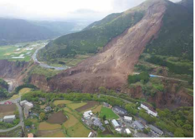
Photo 1. Surveying cracking caused by the Photo 2. Large-scale collapsed slope near earthquake Aso Bridge