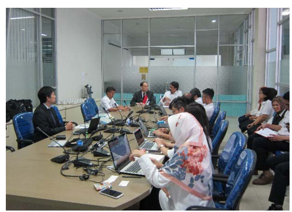
Discussion in IRE (Tunnel)