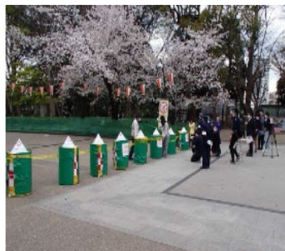
2020: Sakura-dōri closed