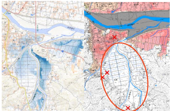
Fig.1 Events of inundation outside the estimated flood / inundation area (2019 Typhoon No. 19) (Left: Estimated Inundation Gradient Tints Map (Geospatial Information Authority of Japan) Right: Added to the Estimated Flood / Inundation Area Map (Sendai Office of River and National Highway) Red "X": Site of personal injury based on the data of Professor Ushiyama at Shizuoka University. * From the Material of the Water and Disaster Management Bureau of the MLIT<sup>3</sup>)

Considering the limitation stated above, the Flood Disaster Prevention Division, giving top priority to the elimination of flood risk information vacuum areas, has developed a simple flood risk information preparation method <sup>1)</sup> using the longitudinal and cross sections of rivers based on LP (airborne laser survey) data, and is supporting the following researches and studies for field use.