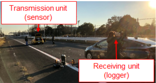
Fig. 1: Experiment using wireless communication

In order to establish a technology using results of this study as a model case and obtain seismic records that contribute to further rationalize / upgrade the seismic design standards for civil engineering structures, we intend to improve seismic behavior observation in the NILIM.