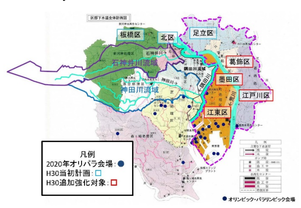
Fig. 2: Area of system expansion to the eastern Tokyo

Fig. 2 shows the area of system expansion to the eastern Tokyo.