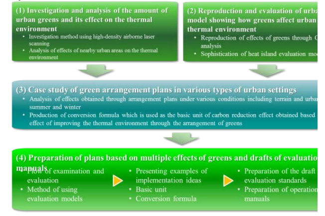
Figure 1. Structure of the study

Figure 1 describes the structure and content of the study.