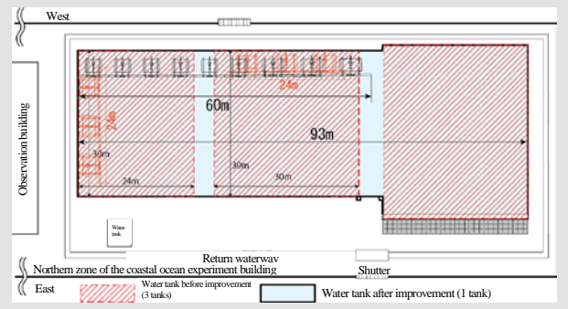
Figure 3: Tank scale after repair

Figure 1: Wave generation facility contributing to study of coastal erosion countermeasure works