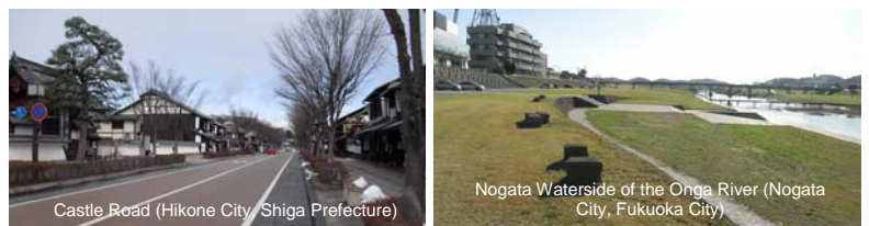
Photo 1. Examples of Landscape Creation Analyzed

Based on such a classification of effects, the interrelationships between effects and the landscape creation methods which contribute to the manifestation of effects will be analyzed to clarify the effects manifestation process. And based on the results of such analysis, the guideline for use by field technologists implementing public works projects will be prepared.