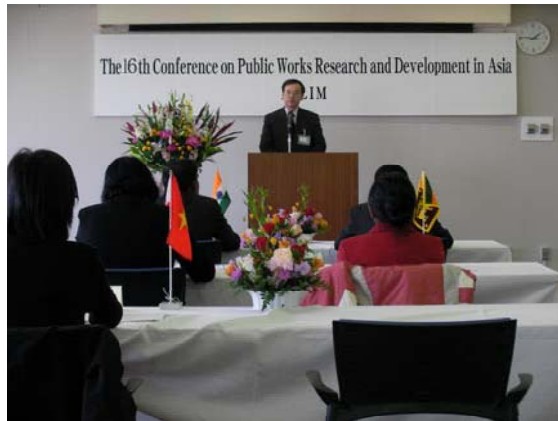
Opening Ceremony Nov. 26, 2007