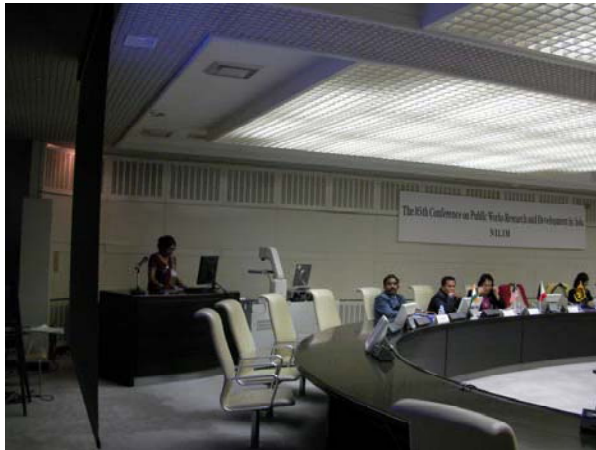
Session on Subject of Common Interest Nov. 28, 2007