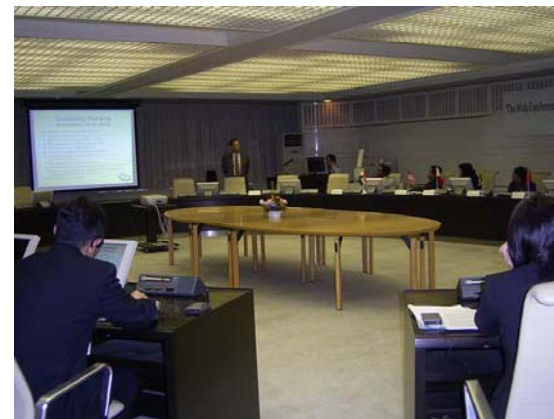
Keynote lecture Nov. 27, 2007