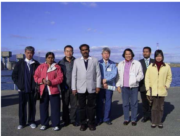
Study Tour in Fukuoka Dec. 5, 2007