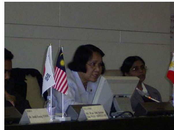
General Discussion Dec. 7, 2007