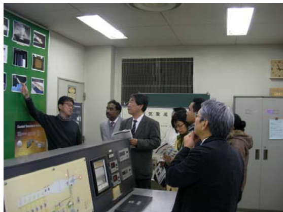
Observation Tour of Meteorological research Institute Nov.27, 2007