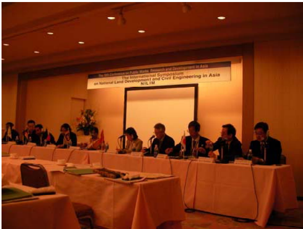
Panel Discussion of the International Symposium Dec. 3, 2007