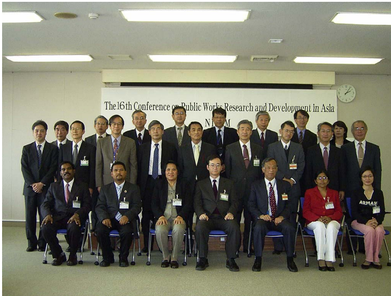
The 16th Conference on Public Works Research and development in Asia