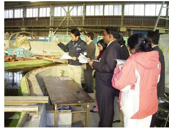
Observation Tour of NILIM & PWRI Nov. 26, 2007