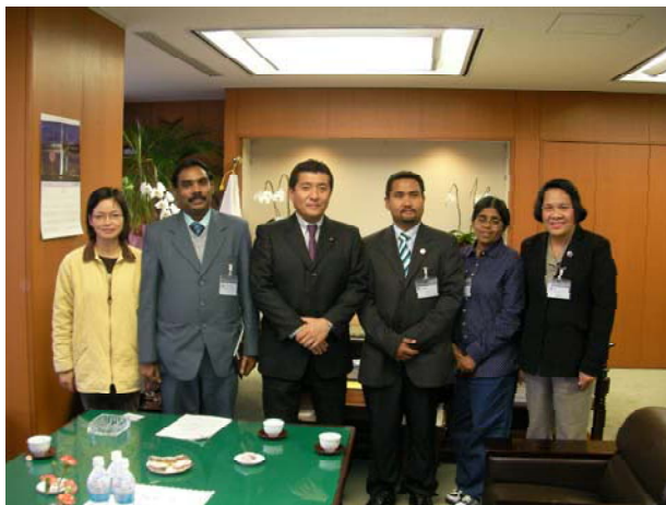
Visit to the Senior Vice Minister of Land, Infrastructure and Transport Nov. 30, 2007