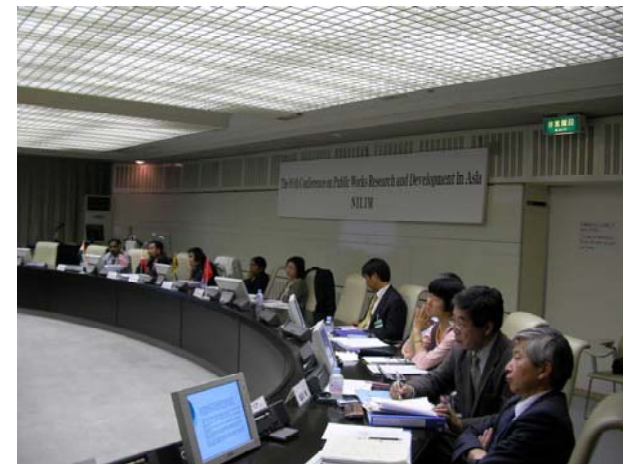
Session on Specific Subject Nov. 29, 2007