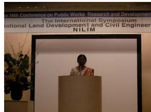
Opening of the International Symposium Dec. 3, 2007