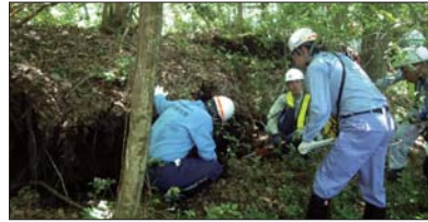
Survey conducted in the vicinity of Takano IC of Matsue Expressway

Based on a request from Chugoku Regional Development Bureau, we provided technical assistance in Hiroshima Prefecture and conducted a survey of damage situations as well as participating in the "Technical Committee for the Disaster Restoration of Kochi Expressway" in Kochi Prefecture.