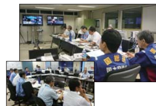
NILIM Meeting of Emergency Disaster Response Headquarters (Hokkaido Eastern Iburi Earthquake, Sept. 6)

http://www.nilim.go.jp/lab/bcg/hokkaidou/saigai_hokkaidozishinn.html