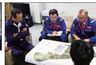
Advising a head of local government (mayor of Atsuma Town) (Hokkaido Eastern Iburi Earthquake, Oct. 2)

Dispatched specialists (Unit: Number of experts/day)