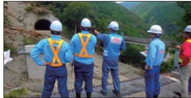
Damage survey on Tajikawa Bridge of Kochi Expressway

In the heavy rain of July 2018, roads were also damaged, resulting in a prolonged suspension of traffic on some seriously-damaged parts, which caused a considerable hindrance to the traffic network.