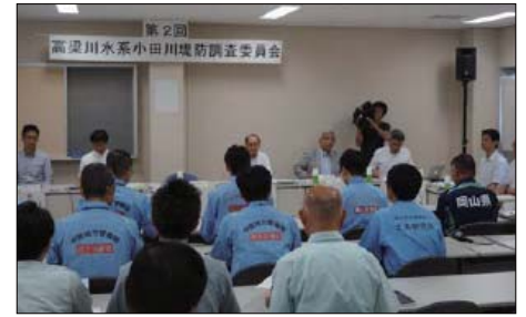
Committee meeting session

Details - Chugoku Regional Development Bureau of the Ministry of Land, Infrastructure, Transport and Tourism website "The Committee for Oda River of Takahashi River-System Levee Investigation" http://www.cgr.mlit.go.jp/emergency/odagawateibochoosa.htm