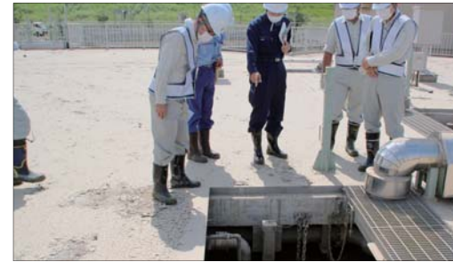
Conducting a damage survey of Mabi Purification Center

In response to Kurashiki City, we sent TEC-FORCE to Mabi Town and participated in the "Study Group for Countermeasure against City Flooding" that responds to flooding disasters, including the heavy rain of July 2018.