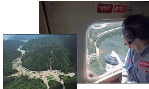
Conducting a survey using a helicopter, and the disaster-affected area seen from above

We carried out technical assistance in relation to the sediment disaster that occurred in Hiroshima, Ehime and Kyoto prefectures by dispatching our staff to those disaster sites.