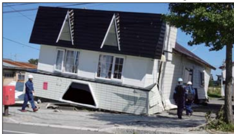
A collapsed dwelling combined with store (Mukawa Town)

After the earthquake struck, in cooperation with the Building Department and Hokkaido Research Organization, we surveyed the damage mainly to wooden buildings.