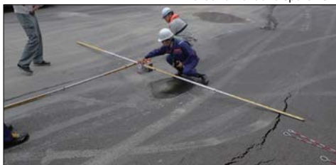
The state of on-site survey

In response to the partial damage that occurred in Tomakomai Port, we dispatched experts to ascertain the damage to the port facilities and to provide technical assistance.