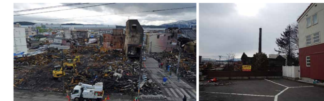
Photo 1. Damage in the center of the fire damaged district

Meanwhile, in the fire-damaged district, some buildings were only slightly damaged, with cracked wired glass for example. The reason is considered to be that the buildings were highly fire resistant, and