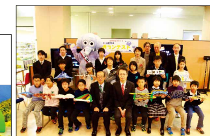
Photo 2. Commemorative photo with prize winners at the awards ceremony