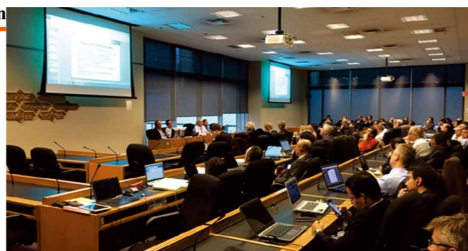
Photo Aerodrome Design and Operations Panel (November at ICAO headquarters)

The NILIM takes part in international conferences held to discuss the planning of facilities, and international standardization of facilities, such as widening airport runways in order to help ensure the safe operation of aircraft.