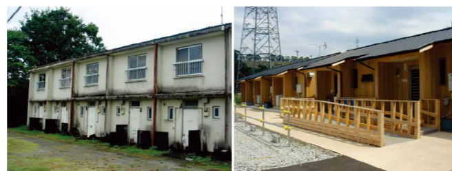
Photo 1: It is necessary to remove deteriorated housing in existing public housing estates and build new public housing. Photo 2: It is necessary to reuse wooden emergency temporary housing to reconstruct damaged public housing.

The NILIM works with the Building Research Institute to provide technical guidance through surveys and studies to restore homes and hamlets, etc. in cities, towns, and villages damaged by the Kumamoto Earthquake.