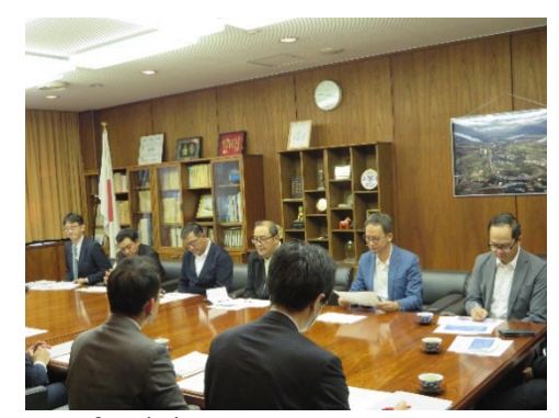
Exchange of opinions

They visited three kinds of facilities, "Test Track", "Full-scale tunnel experiment facility", and "30MN large-scale universal testing machine".