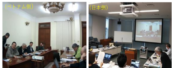
Photo-2 Scenes of internet workshops with Vietnam