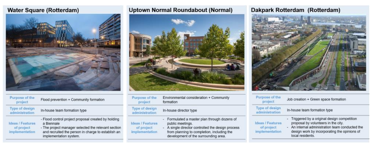
Fig. 2: Overview of the three overseas examples