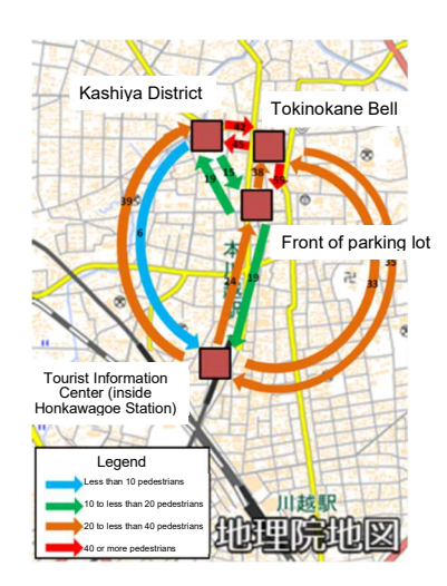
Figure 1: Movement status

Meanwhile, the study found large differences in the magnification ratio compared (ratio to actually measured values) depending on the location and time zone. (Figure 2) A possible cause was that the sensor installation environment mav have affected the outcome.