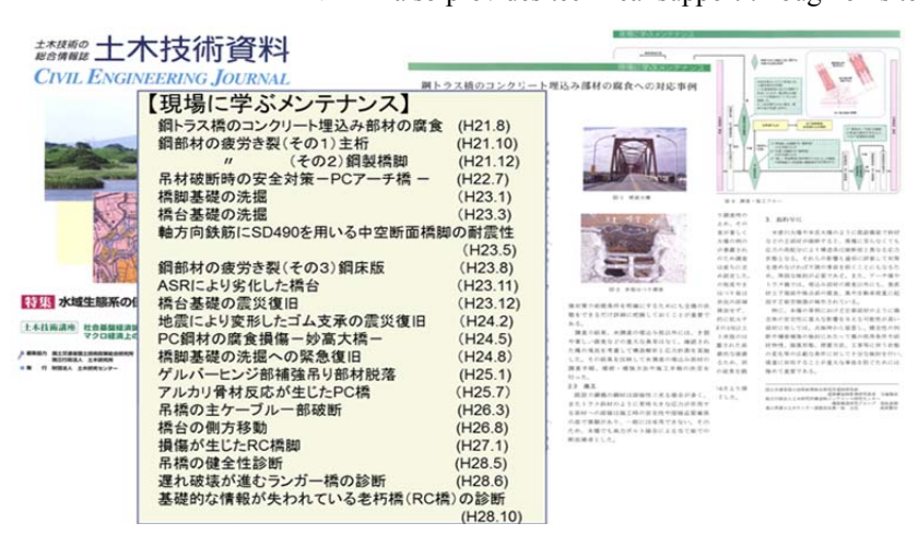
Figure 2 Maintenance learned at actual sites

NILIM also provides technical support through on-site