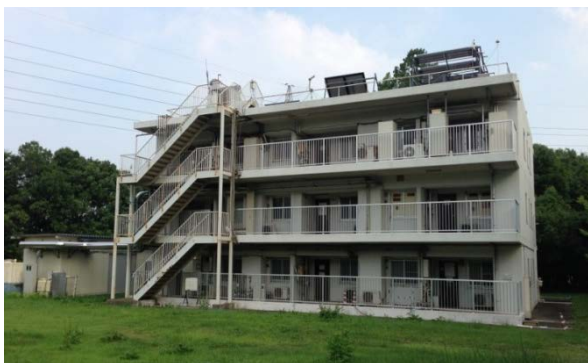
Photo. Investigation of energy consumption by simulating lives of people

The Housing Department is using the outcomes of these experiments and investigations to develop and distribute programs to evaluate energy consumption. Specific computation methods (formulas) used in the programs and grounds of the methods are described in a technical reference to ensure transparency as much as possible.