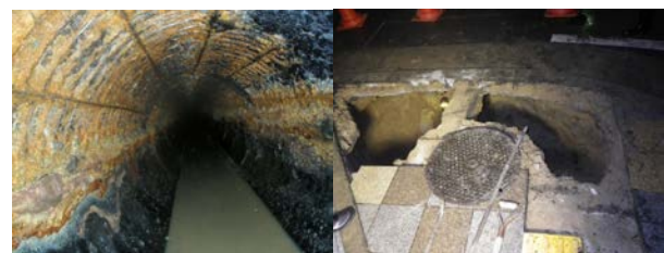
Figure 2: Corroded wastewater pipeline (left) and cave-in of walkway (right)