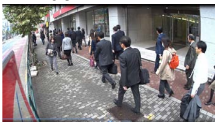
Photo: Sidewalk near Shinbashi Station

For case 1, the team selected Roppongi, Ueno, and Nihonbashi subway stations on weekdays from 15:00 to 18:00, when the subway stations were crowded with people on shopping. For case 2, the team selected the sidewalk of Sotobori-dori Street near Shinbashi Station on weekdays from 8:45 to 9:00, during which most people walk in the same direction to go to work. The team observed pedestrians using video cameras and collected walking speed and other conditions.