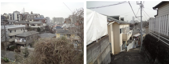
Photo 1. Hilly urban areas

Buildings are constructed along terrain features of hilly urban areas. Thus, characteristics of such areas include buildings constructed in step-like arrangements, retaining walls, not many roads where cars can drive on, many roads in step-like arrangements, and narrow roads. Thus, fire is expected to spread differently, and people evacuate from fire differently from flat terrain. Yet, actual differences are not clearly known.