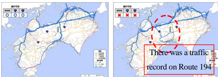
Figure 1 Normal time

Because of the heavy rain caused by typhoon No. 12 in August 2014, the route between Kawano JCT and Susaki Higashi IC on the Kochi Expressway was closed for approximately 61 h from August 2nd to August 5th. We analyzed the ETC2.0 probe information and obtained the vehicle traffic paths for the normal and closed times, as shown in Figure 1 and Figure 2, respectively. A comparison and analysis of the data confirmed that national highway Route 194 was used as an alternative to the Kochi Expressway and Route 32 during the heavy rain.