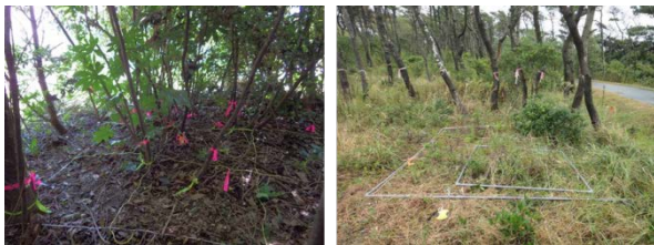
Photo 1: Locations of sampling Left: Artificial broad-leaved forest (Izumo-shi, Shimane), Right: Pine trees on the dune (Fukuroi-shi, Shizuoka)

The surface of the specimens were divided into lattices to measure the variation of erosion depth with time in each lattice and compare the perpendicular distribution of erosion depth and the amount of root hair.