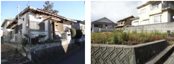
Photos: Examples of Increasing Number of Abandoned Houses and Vacant Lots in Suburban Built-Up Areas

With the rapid aging and decline of the population in Japan, we have been seeing an increasing number of abandoned houses and vacant lots in the suburban areas of cities (see photos below), decaying local communities, a deterioration in the quality of life from the removal of facilities to enhance the convenience of life and other causes, and an increase in local governments' expenditures under severe fiscal constraints to support elderly care and welfare, as well as the operation and maintenance of public infrastructure, among other things. These and other urban problems may likely become increasingly more serious going forward. Given these circumstances, a shift in urban structure to a more centralized one is one of the major tasks of urban planning today. To support local governments' efforts to develop cities with a more centralized urban structure, NILIM is currently engaged in the development of a prototype Simplified Cost-Benefit Evaluation Tool regarding the operation and maintenance of public infrastructure and services at the district level, which NILIM believes is useful for reference when local governments consider the development of policies and