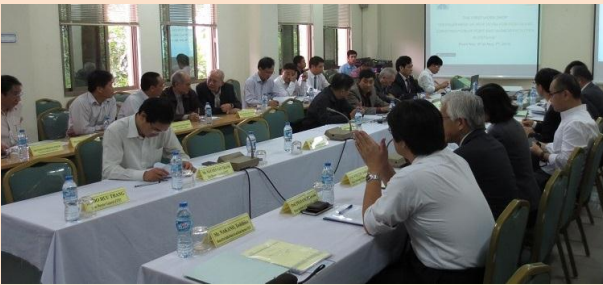
Photo Workshop in Vietnam

and Material Conditions volumes, and prepared a rough draft of standards for Vietnam. The main items discussed were, in connection with general provisions, the thinking on the design working life and degree of importance of structures; in connection with loads and actions, the setting of wave conditions and earthquake conditions; and in connection with material conditions, specifications that consider the durability of steel materials and concrete. The coming fiscal year is the final year of this research. We plan to prepare draft standards for foundations and ground improvement and facility design standards specializing in structural types of breakwaters and mooring facilities which are widely used in Vietnam. We will also finalize the full set of standards in the coming year.