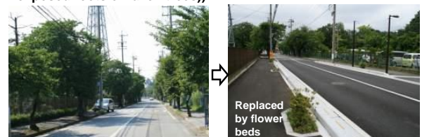
Photo Examples of Restoration of Street Tree