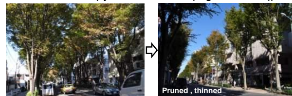
Redevelopment case (street trees obstruct traffic (danger of exposed roots or fallen trees))