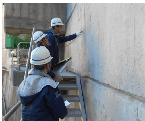
Photo. A Scene of Comprehensive Dam Inspection (On-site check by experts)

There are about 70 dams in Japan that have been operating more than 30 years since the start of management by the MLIT and the Japan Water Agency (JWA), and they have been undergoing the Comprehensive Dam Inspection in turn since October 2013. As shown in Figure, "experts" give comments / advice when "preparing inspection plan" and "preparing the soundness and maintenance policy (draft)" for civil engineering dam structures. The personnel of NILIM and PWRI responsible for dam structures and dam geology have been providing technical support in the position of "experts" to ensure effective implementation of Comprehensive Dam Inspection. The number of dams involved until the current fiscal year amounts to 46, including 5 dams under control of local governments.