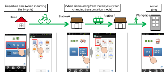
Figure 1. Image of Operation of the Application

studying the preparation of a bicycle network plan.