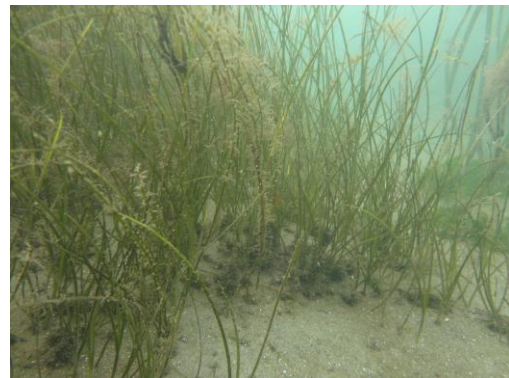
Photo. Eelgrass in Miyako Bay

This survey reveals that many places with sediment conditions suitable for use as habitats by eelgrass remain. We wish to continue monitoring in anticipation of the small scale eelgrass beds which remain steadily expanding a little at a time into their surroundings and the eelgrass beds confirmed to be dense communities acting as supply sources restoring eelgrass beds over a wide area.