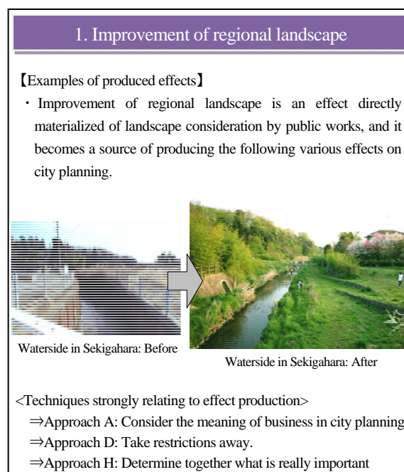
Figure-2 Example of effects