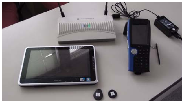
Photo 1. Hardware configuration of the basic application