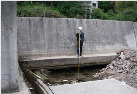
Photo: A field survey in progress

From May 9th to September 1st, a total of seven employees from the Coastal and Marine Department were sent to survey the state of damage to coastal protection facilities 2) .