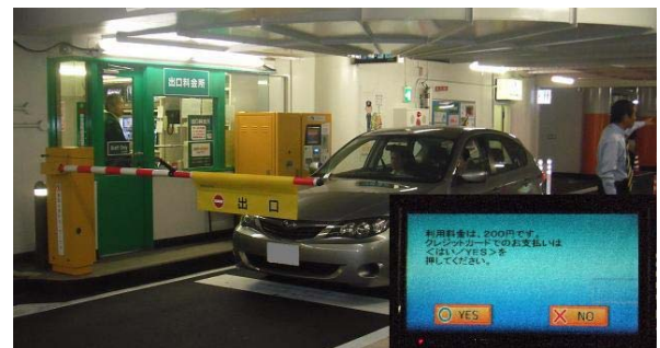
Figure 2. View of the Test and Car Navigation Operating Screen

Vehicles passed smoothly through the entrance gate, confirming that the entrance gate system is operationally feasible. But it takes longer to pass the exit gate than the entrance gate because of the long time needed to settle the parking charge. To deploy the system operationally, it is necessary to shorten the settlement time at the exit gate.